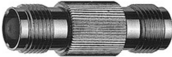
Fig. may differ