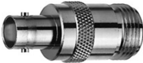
Fig. may differ