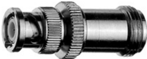
Fig. may differ