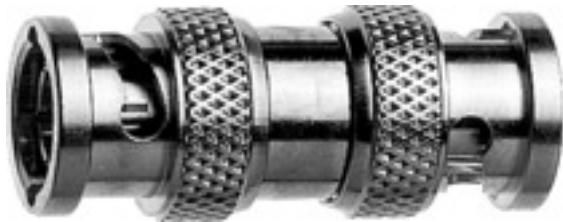
Fig. may differ