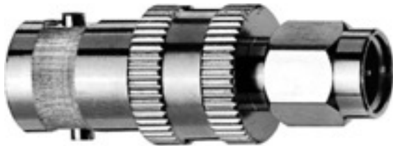
Fig. may differ