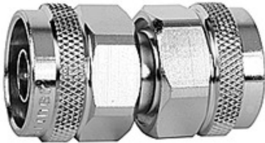
Fig. may differ