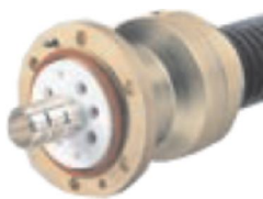
3-18" EIA Flange